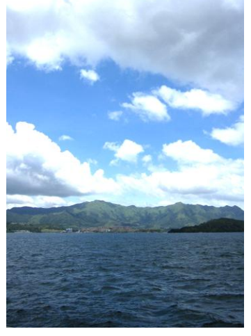
The water quality of Tolo Harbour has been improved significantly